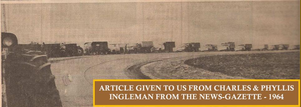
ARTICLE GIVEN TO US FROM CHARLES & PHYLLIS INGLEMAN FROM THE NEWS-GAZETTE - 1964

BRINGING IN A BIN-BUSTING CROP. These three pictures show what happens when a record-breaking corn crop is dumped on elevators faced with a short supply of railroad cars. This lineup took place last week