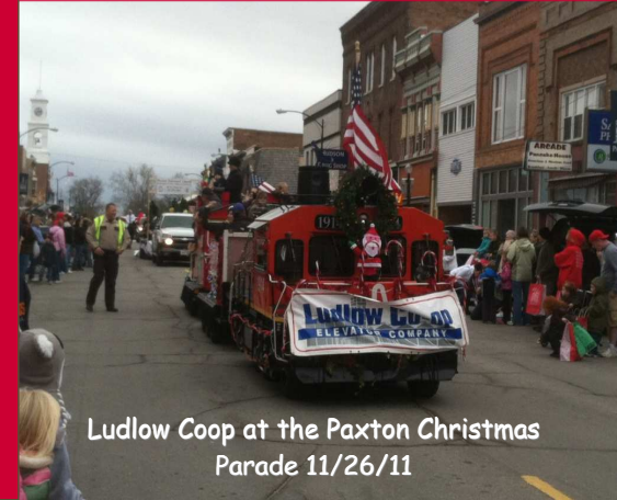
Ludlow Coop at the Paxton Christmas Parade 11/26/11